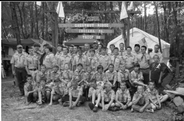
Above, Scouts from Troop 29 attended 2011 Summer Camp at Camp Seph Mack. The weather and food couldn't have been better.

Mountainfest – Council Camporee — To celebrate the creation of the new Laurel Highlands Council, there will be a camporee held for all scouts from across the former Penn's Woods and Greater Pittsburgh Councils. The event will take place at Heritage reservation in Farmington, PA and will be structured similarly to Campaganza. The camporee runs from September 16 th – 18 th . The closing